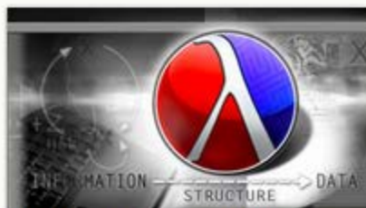
Introduction to Systematic Program Design - Part 1 Sep 4th 2013