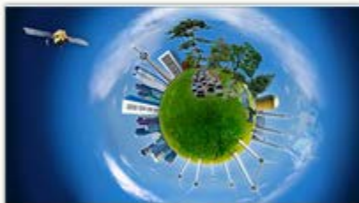
Climate Literacy: Navigating Climate Change Conversations Sep 30th 2013

The University of British Columbia is a global centre for research and teaching.