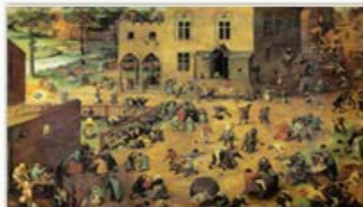
Game Theory Oct 14th 2013