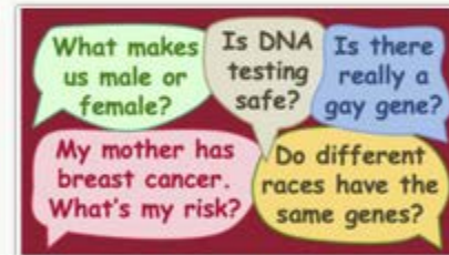
Useful Genetics Part 1 Nov 1st 2013