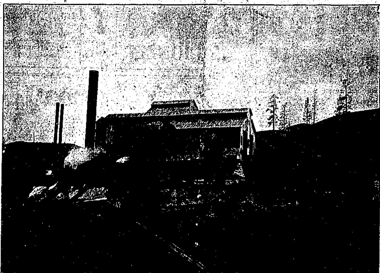
MONTREAL AND BOSTON SMELTER.

Engineers and Capitalists are Enthusiastic.