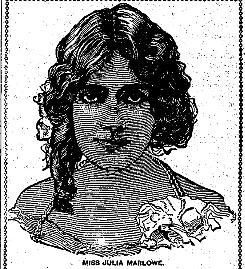
MISS JULIA MARLOWE.

In a recent letter to The Peruna Medicine Co., Miss Julia Marlowe of New York City, has the following to say of Peruna: