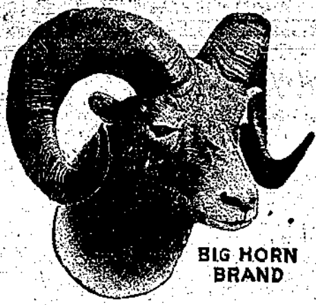
BIG HORN BRAND

FOR SALE BY SHATFORDS, LIMITED Hedley and Fairview