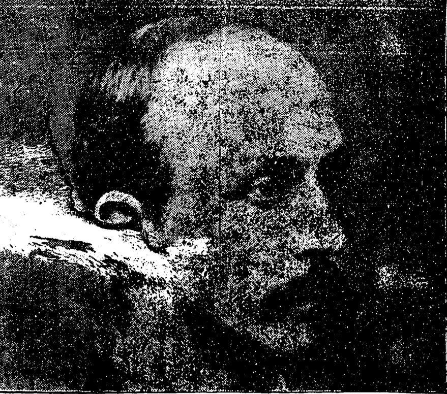
EARL GREY