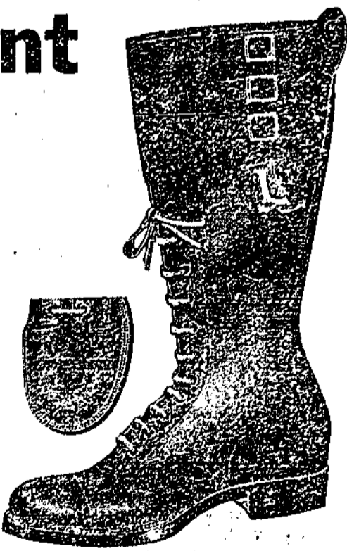
L 811 16 in. Oil Tan Prospector

Our Loggers', Miners', Prospectors' and Boys' Shoes are THE BEST THAT MONEY CAN BUY