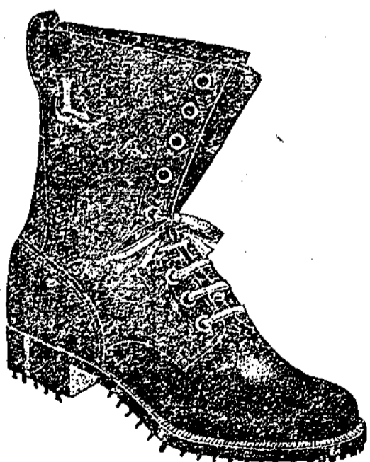
10 in. Hand Made Logger "BEST FOR THE WEST"