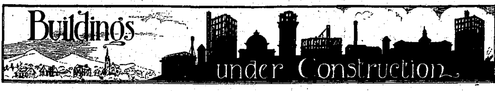
THE FOLLOWING TABLE SHOWS BUILDINGS COSTING $5,000 OR OVER, ON WHICH CONSTRUCTION IS UNDER WAY, OR ON WHICH CONTRACTS HAVE BEEN LET BUT CONSTRUCTION NOT YET STARTED.