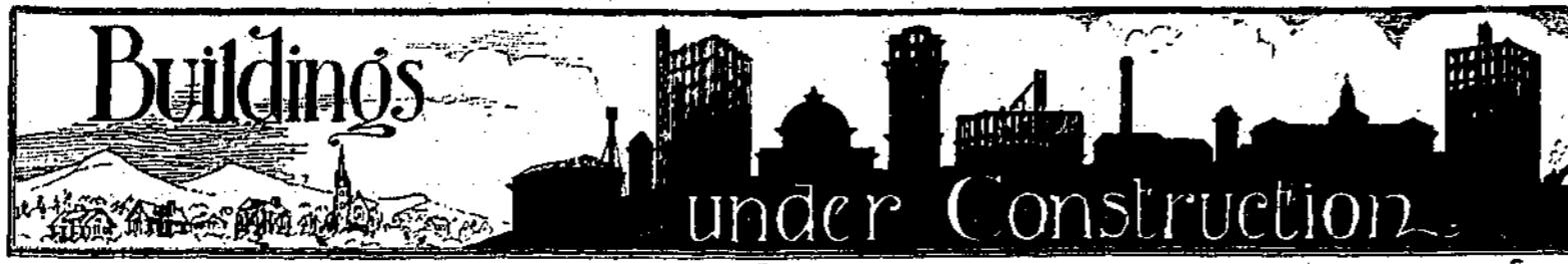
THE FOLLOWING TABLE SHOWS BUILDINGS COSTING $5,000 OR OVER, ON WHICH CONSTRUCTION IS UNDER WAY, OR ON WHICH CONTRACTS HAVE BEEN LET BUT CONSTRUCTION NOT YET STARTED.