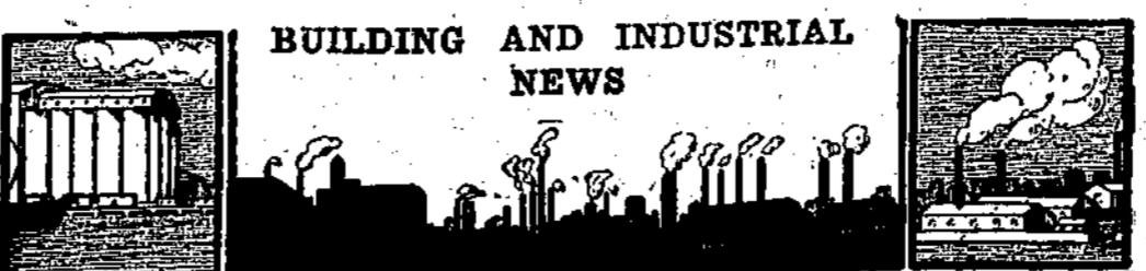
BUILDING AND INDUSTRIAL NEWS