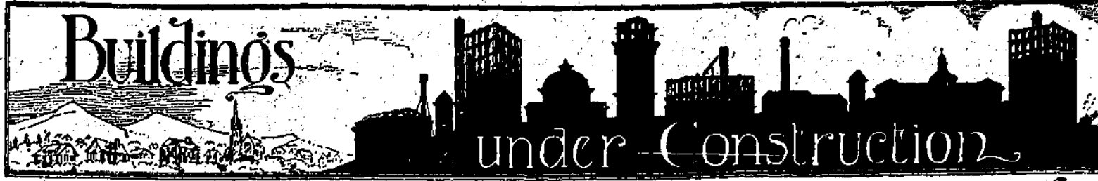
THE FOLLOWING TABLE SHOWS BUILDINGS COSTING $5,000 OR OVER, ON WHICH CONSTRUCTION IS UNDER WAY, OR ON WHICH CONTRACTS HAVE BEEN LET BUT CONSTRUCTION NOT YET STARTED.