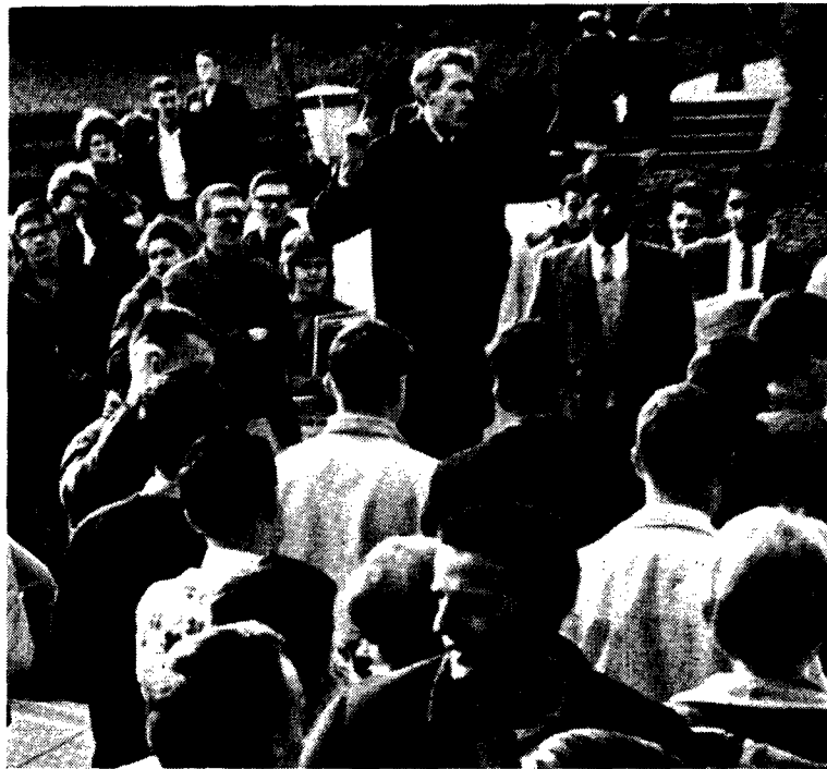
THEY HEARD, THEY MARCHED

● Feb. 14, the provincial government's budget ignored the Macdonald report. The UBC board of governors remained silent.