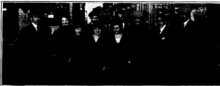
THE DES MOINES DELEGATES