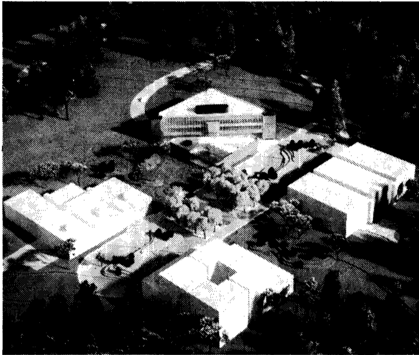
Model by Russell Vandiver Architects shows how Discovery Park buildings would be clustered in centre of site and surrounded by green belt.