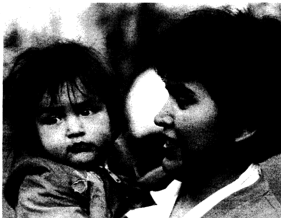
NITEP students often have family or community responsibilities.

For the increasing number of international students on the UBC campus, the English Programs division of the Language Institute offers a range of specialized non-credit English courses designed to meet their various needs. Students can enroll for college preparation, for example, or simply improvement of speaking skills.