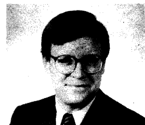
Journalist Jeffrey Simpson

The series is directed by a distinguished group of people from the private and public sectors including: the Lieutenant-Governor of B.C., the Chief Justice of B.C., the Chairman of the Vancouver Board of Trade, the Chancellor, the Chairman of the Board of Governors, the President of the University, the Deans of the faculties of Arts, Commerce and Law, and the President of the UBC Alumni Association.