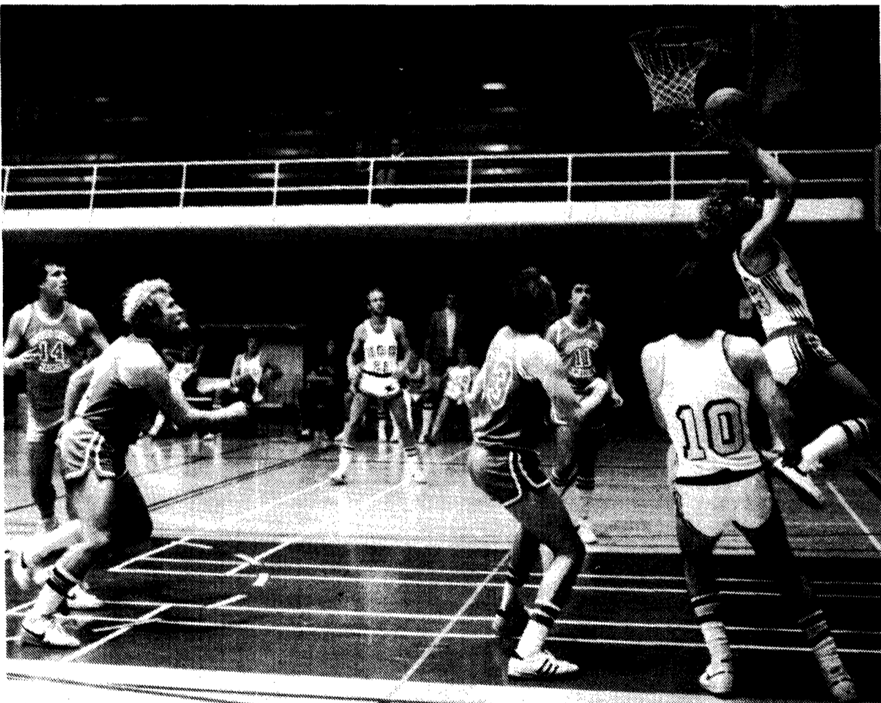
UBC Thunderbirds basketball team (white jerseys) had little trouble polishing off this Senior A Dogwood team last week as they prepared for their annual Buchanan