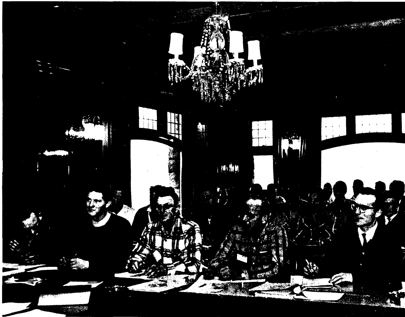
CHANDELIERED BALLROOM of Yorkeen House on the UBC campus was a classroom recently for these B.C. fishermen taking an intensive three-week course designed to acquaint them with the latest developments in a wide range of areas, including fishing techniques, navigation

and marine law. The annual program, sponsored by the UBC extension department and the federal department of fisheries, has increasing enrolments each year. This is its 27th year of operation.