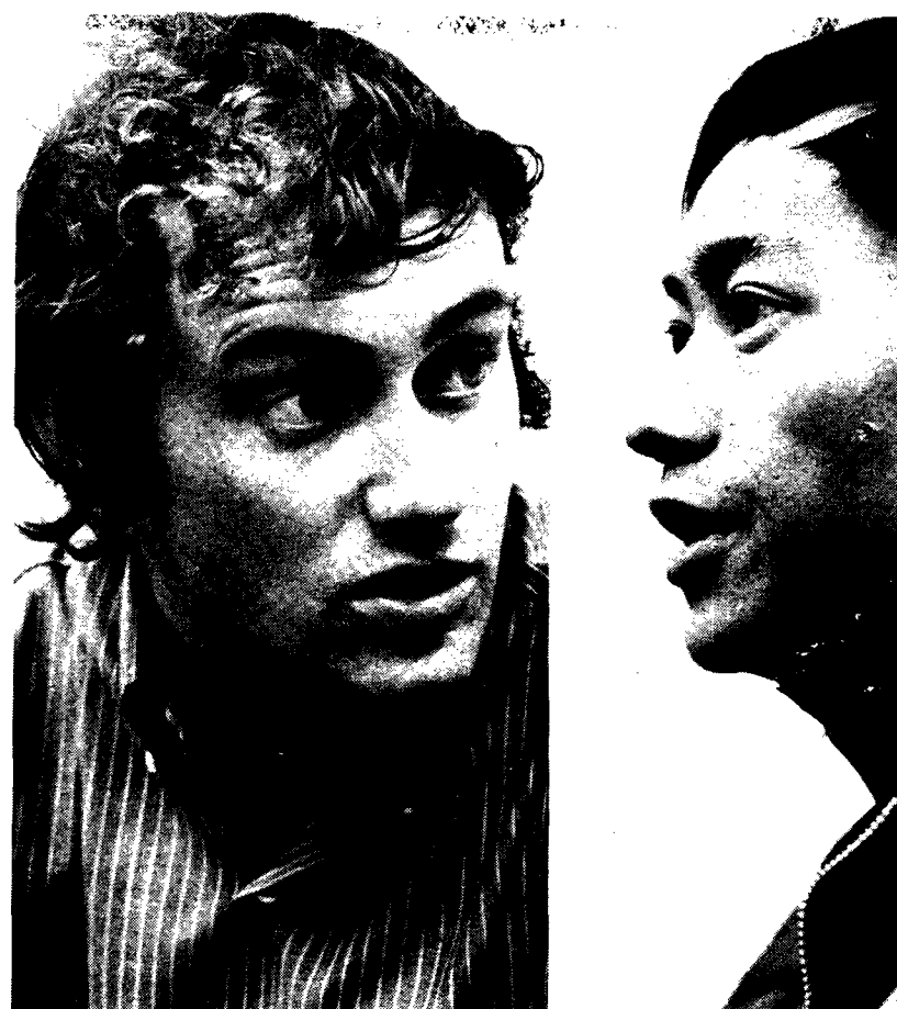
A few of the key figures who worked feverishly to contain the SUB occupation