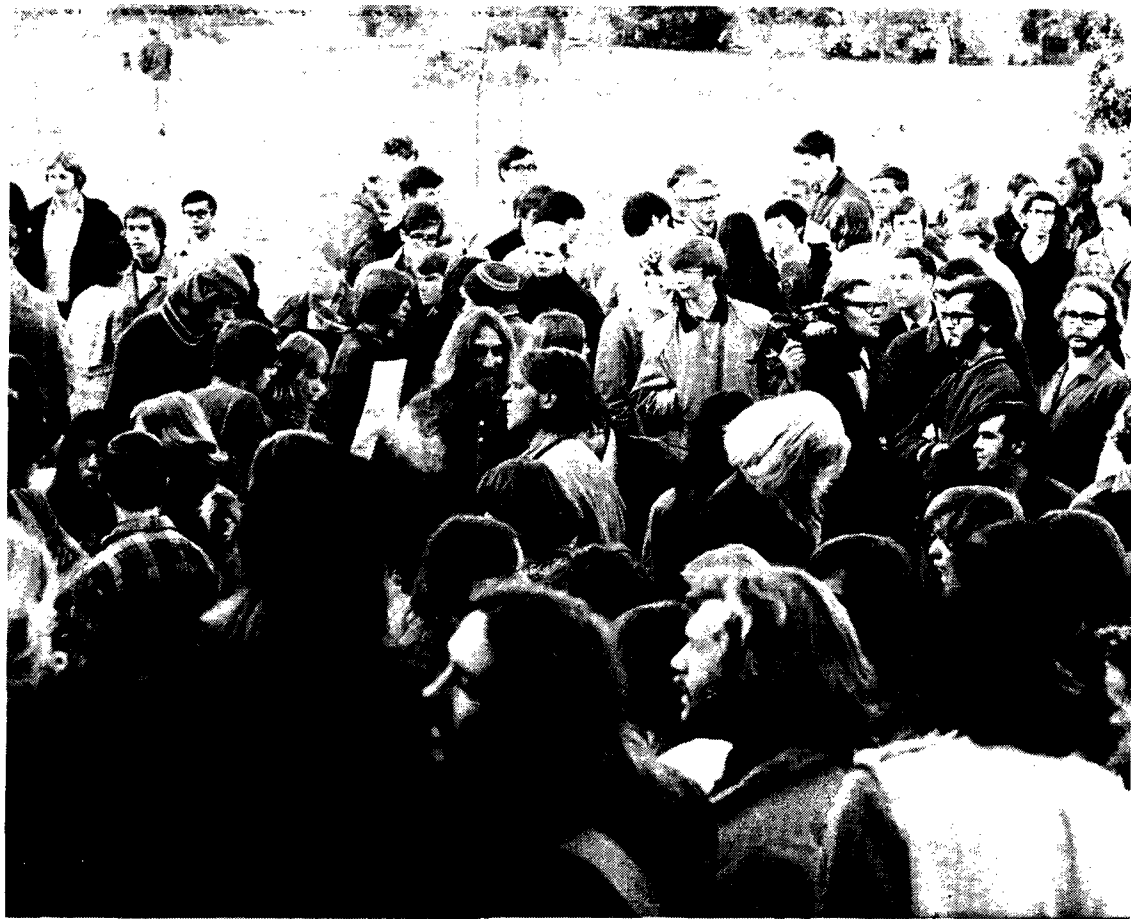
Jericho transients left the SUB at 8 a.m. Friday (Oct. 16) and milled around on the lawn west of