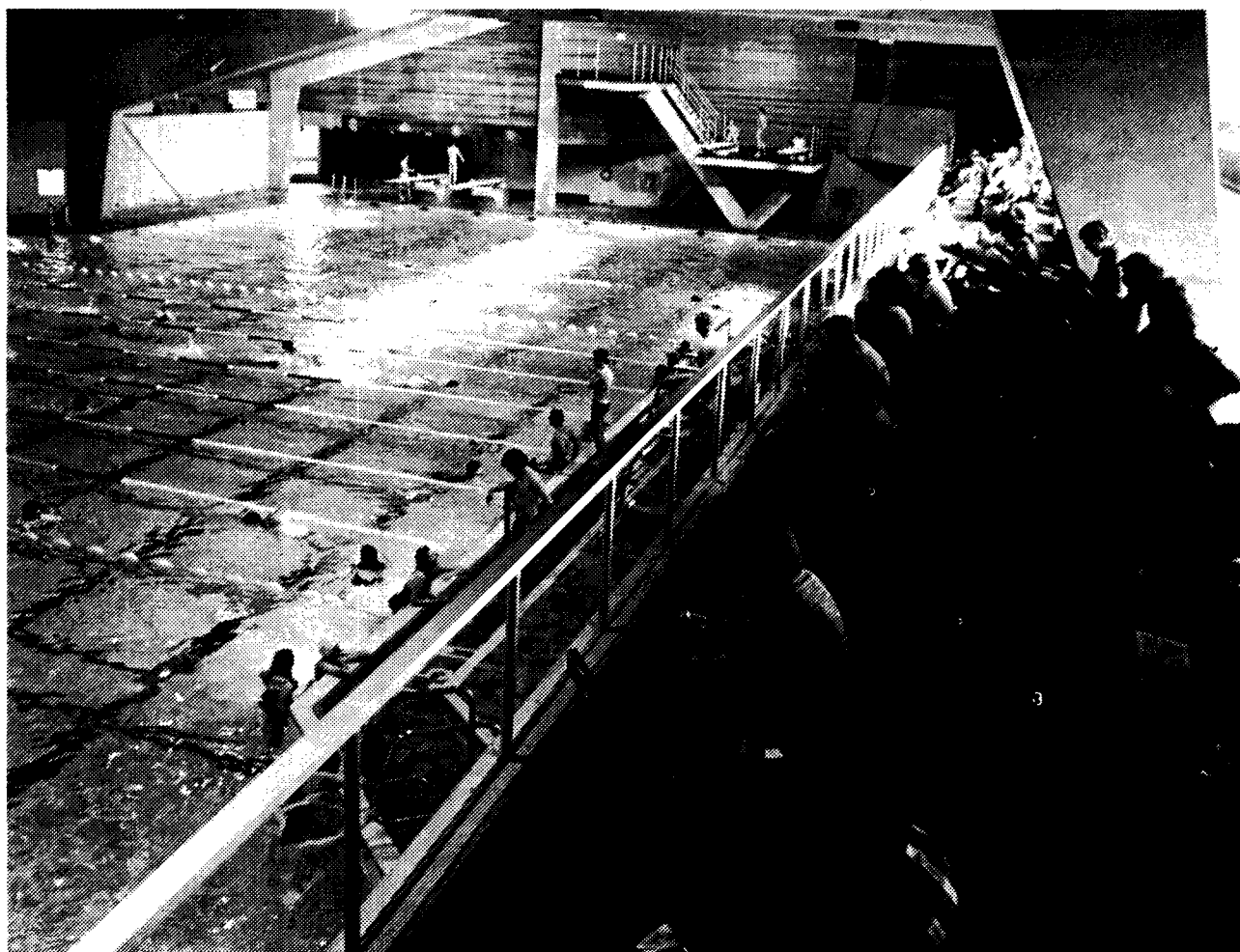
Spectator area overlooking the swimming pool in UBC's new Aquatic Centre proved to be a nice, warm place to eat lunch, socialize and watch the action below during Vancouver's recent cold snap. Centre's architects, Carlberg Jackson and Partners, have been awarded the 1978 gold medal for international non-residential pools in a competition sponsored by the publication Swimming Pool Weekly and Swimming Pool Age .

Please turn to Page 2 See STUDENT SERVICES