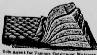
Sole Agent for Famous Ostermoor Mattress.

For the next two weeks we will occupy the entire Hart Block and during that time we shall offer some Great Values in Furniture and Home Furnishings