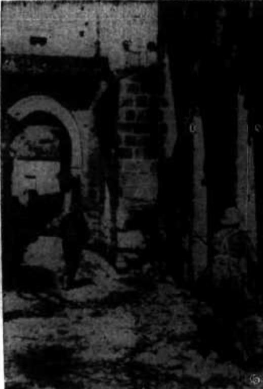
ON PROWL FOR NAZI SNIPERS: British soldiers edulstously advance through a street of Nicotello, Italy, on the hunt for Nazi snipers.