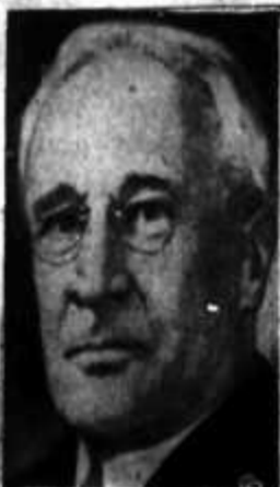
AMBASSADOR: Hon. Leighton McCarthy who steps up from the status of Canadian Minister Plenipotentiary and envoy extraordinary at Washington to that of Canadian Ambassador to the United States.