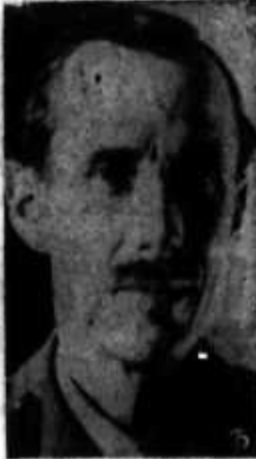
TO SOUTH PACIFIC: Lieut-General Sir Herbert Lumsden, named by Prime Minister Winston Churchill as his special representative to General Douglas MacArthur.