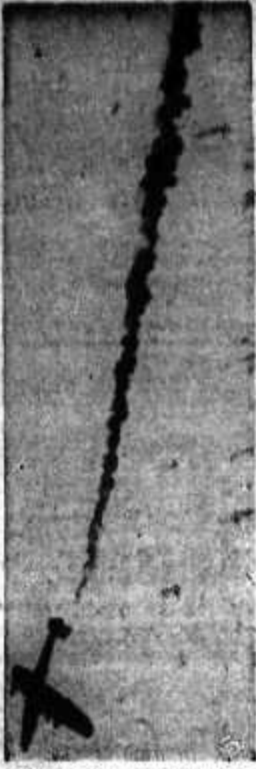
DOWN GOES JAP: This four-engine giant, a Jap Mavis, after a run-in with an Allied Liberator, found itself with flames shooting from both wings, plummeting toward the smooth Pacific shedding wings and debris.