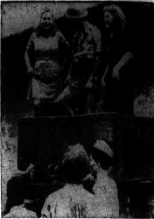
RARE VINTAGE IN THE MAKING: A British soldier of the Allied Eighth Army helps two Italian girls tread grapes for wine production. Those calloused feet, which evidently pounded many a long trail in pursuit of the fleeing Nazis, should help turn out a very special vintage.