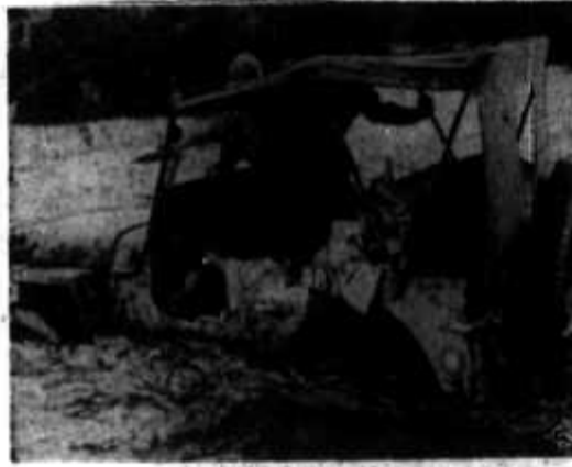
NOTHING DAUNTS THE ALLIES: When the Germans destroyed a bridge across a river near Caserta, Italy, they failed to delay the Allied advance to any appreciable extent. Shown here is a jeep with British soldiers in mid-stream, pictured passing the blown-out bridge.