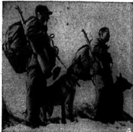
Two soldiers with their U. S. Army dogs on sentry duty at an advanced Aleutian base.