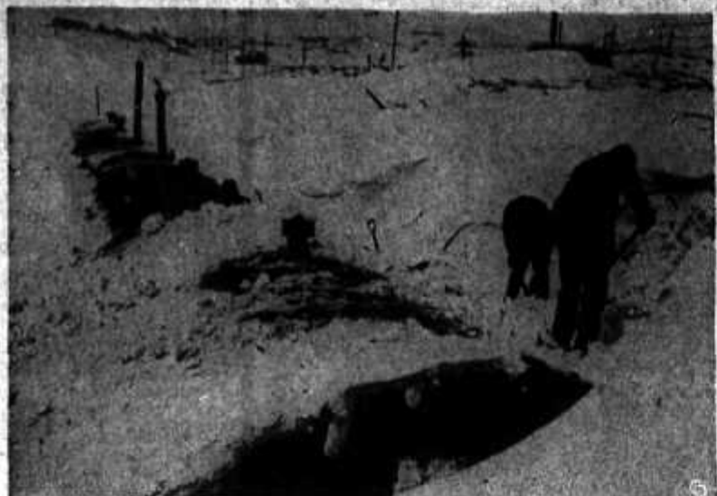
This is how the boys at an advanced Aleutian base did their snow shoveling after one of the frequent blizzards (Williwaws) that strike this region. Snow is piled high on top of the Quonsets and shelters are completely buried under the tons of snow driven by the 100-mile-an-hour wind.