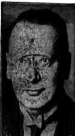
Soviet Ambassador Maxim Litvinoff, who has been called to Moscow from Washington for consultation. It was understood the call had no connection with the recent break in Soviet-Polish relations.