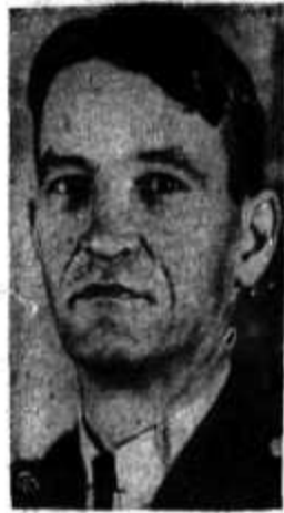
Lt. Gen. Joseph W. Stilwell, top, Commander of the United States Army forces in the China-Burma-India theatre; Maj. Gen. C. Chennault, Commanding General of the 14th Air Force in China, arrived in Washington Wednesday for a conference with Chiefs of Staff.