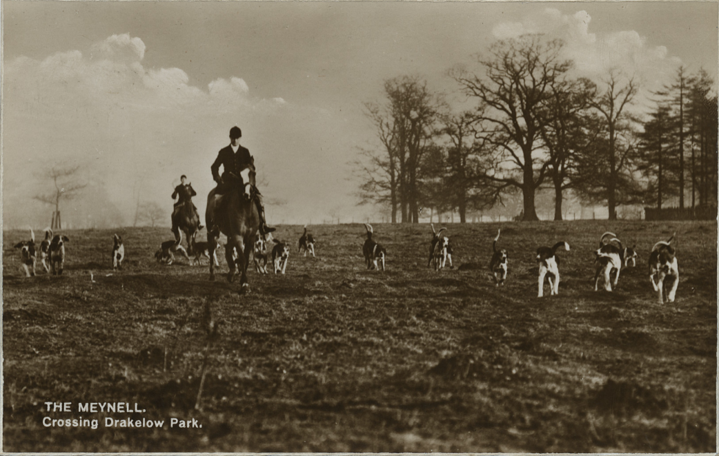
THE MEYNELL. Crossing Drakelow Park.