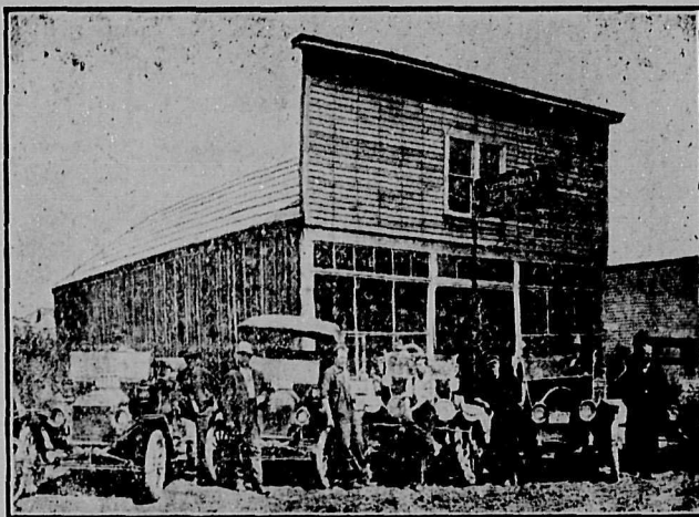
CITY GARAGE, SOUTH FORT GEORGE, B. C.

Among the happy outcomes of the many questions of the hour, we note with pleasure, that at home in England and Ireland - friends and neighbors for the moment have forgotten their troubles and differences in the Irish question and joined hands for the honor of the Empire, and in this we may see the blowing away in fraternal feeling; this vexed question and the saving of a situation that bid us look with fear and trembling for bloodshed among brothers. Let us hope that in the larger question of the European situation this home matter may find its solution and death to strife within the Empire.