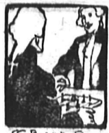
The Hessian General Loved Chess.