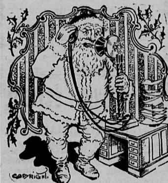
Santa's at Phone 67

Special attention given to work for organized labor generally.