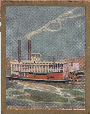
S. S. INTERNATIONAL