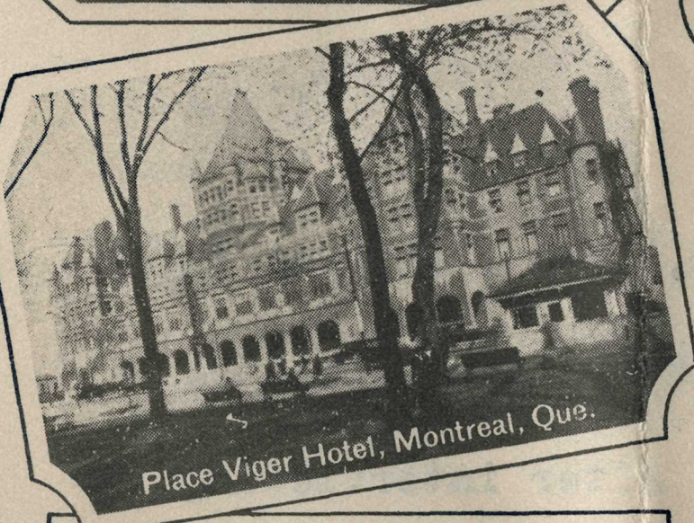
Place Viger Hotel, Montreal, Que.