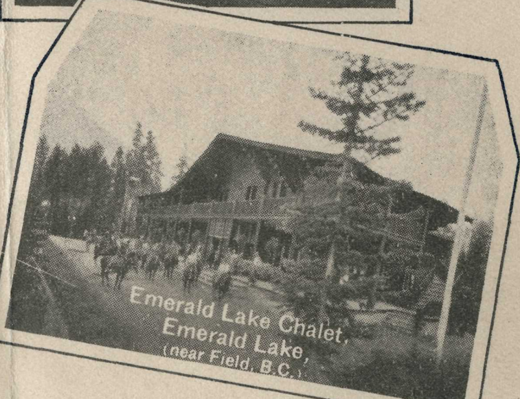
Emerald Lake Chalet, Emerald Lake, (near Field, B.C.)