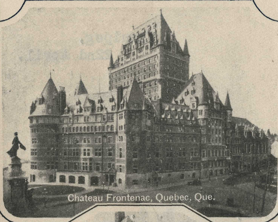
Chateau Frontenac, Quebec, Que.