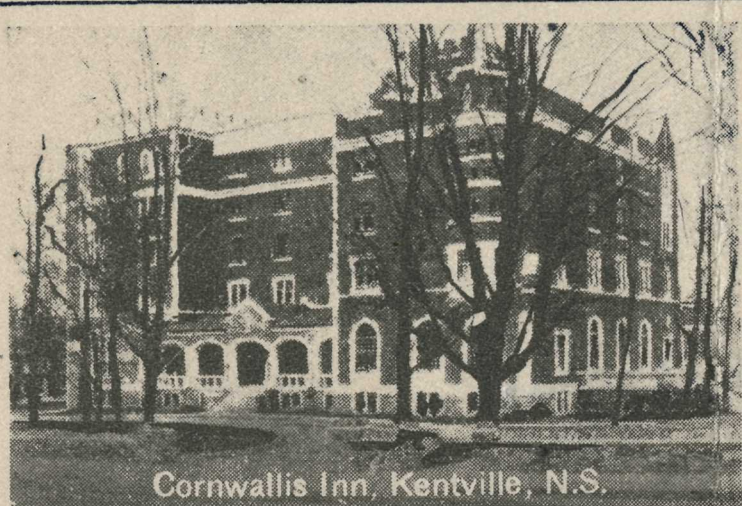
Cornwallis Inn, Kentville, N.S.