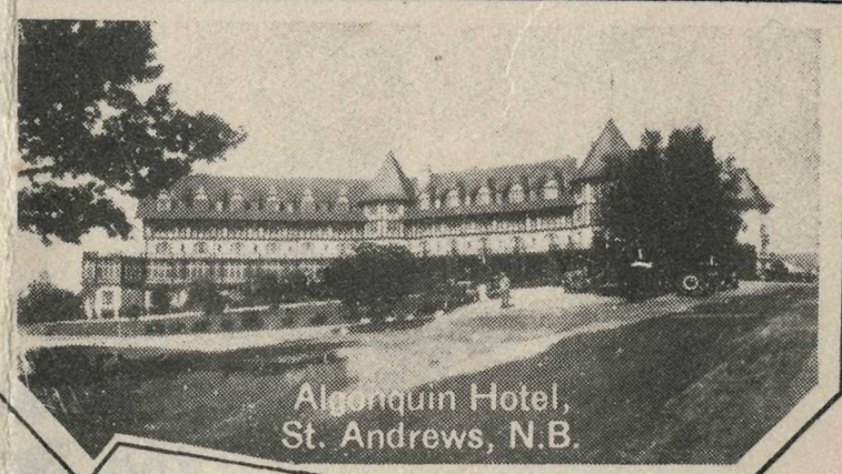
Algonquin Hotel, St. Andrews, N.B.