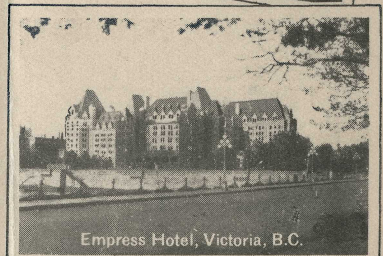
Empress Hotel, Victoria, B.C.