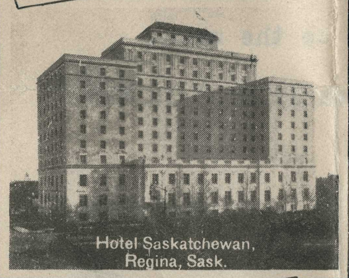
Hotel Saskatchewan, Regina, Sask.