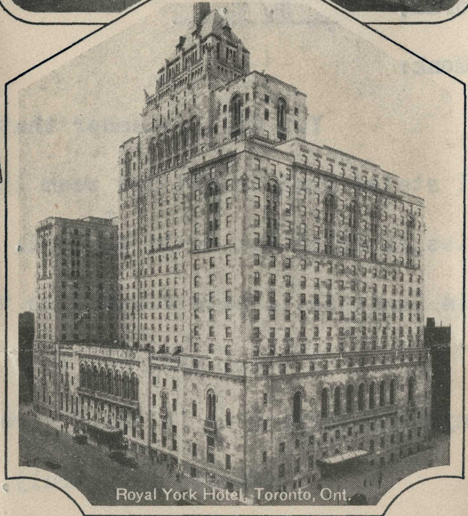
Royal York Hotel, Toronto, Ont.