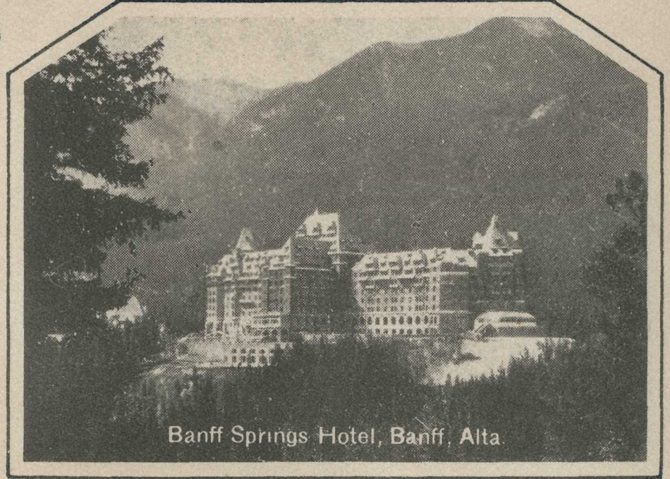
Banff Springs Hotel, Banff, Alta.