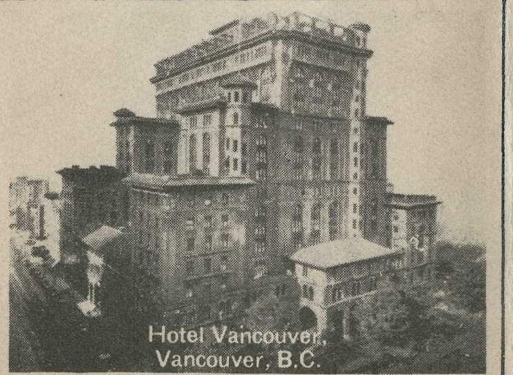
Hotel Vancouver, Vancouver, B.C.