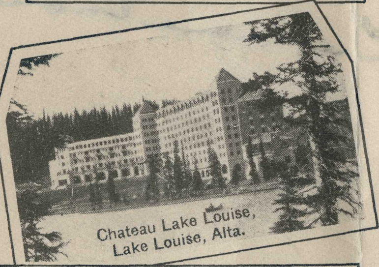
Chateau Lake Louise, Lake Louise, Alta.