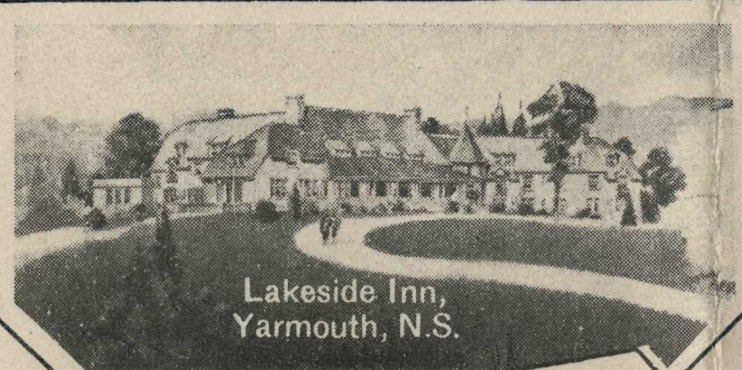
Lakeside Inn, Yarmouth, N.S.