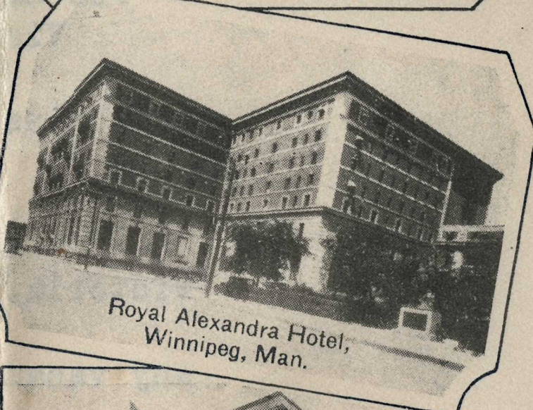
Royal Alexandra Hotel, Winnipeg, Man.