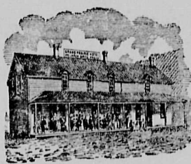
Grand Prairie Hotel.