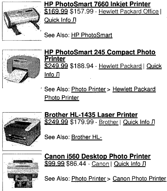
Figure 1.1: An Example Web Page

<printers> ..... <printer><model>HP PhotoSmart 7660 Inkjet Printer</model> <brand>Hewlett Packard Office</brand> <price>$157.99</prince> </printer> <printer><model>HP PhotoSmart 245 Compact Photo Printer</model> <brand>Hewlett Packard</brand> <price>$188.94</prince> </printer> ..... </printers>