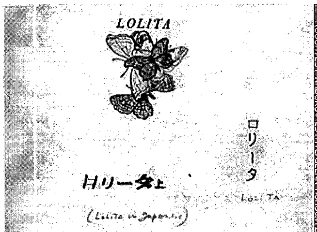
Figure 1: Butterflies drawn by Nabokov

< http://www.cnn.com/SPECIALS/books/1999/nabokov >