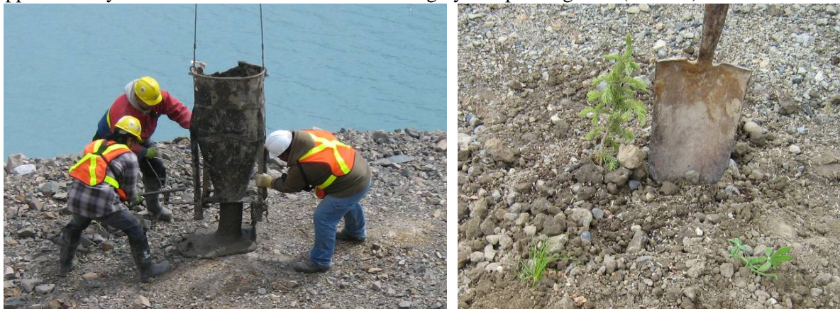
Photo 3. Soil delivery to Borrow 3 via helicopter and soil pocket planting with native species

Borrow 3 is located on the north side of the Tailings Storage Facility (TSF). This borrow was one of the rock and overburden sources used during early construction of the TSF. Later borrow development consisted of mining talus for filter materials. Machine reclamation work was carried out in this area in 2005, including recontouring of old borrow benches and development trails. The steep rocky slope section of Borrow 3 was addressed during the 2009 reclamation activities. The objective of the 2009 program was to create micro-sites or “pockets” for establishment of vegetation on the exposed rock slope. Some pockets of vegetation have already established naturally in this area, and the intent was to augment these with additional sites. A lack of a suitable growth medium at the borrow area meant soil had to be moved to the site. Overburden from the mine site was mixed with water to form a slurry in preparation for relocation. Due to difficult access, a helicopter was used to sling the slurry to the borrow. Approximately 7 m 3 of soil was moved to create roughly 150 planting sites (Photo 3).