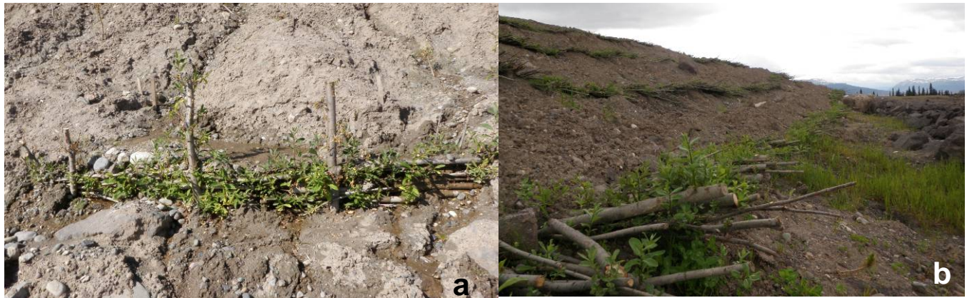
Photo 1. Willow wattle fences on Borrow 7 seepage areas (a), and willow brush layers for improvement of surficial soil stability (b).

Willow staking has been conducted on site in various areas since 2000. Due to the large willow collection programs conducted in 2009, application of a greater number of bioengineering techniques (Polster, 2005) was possible in summer 2009 and 2010. Willow wattle fences (Photo 1a) were applied on hillsides with known seepages, in combination with live pole drains and willow staking. Brush layers (Photo 1b) were applied to slopes with surficial instability, and live pole drains were installed in talus areas to reduce rilling and to direct surface water to diversion structures.