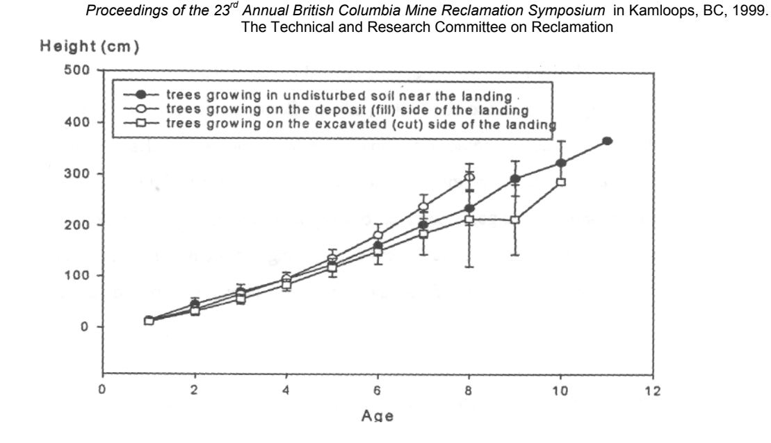
Figure 2. Caven 1 landing. Relative to the trees growing in undisturbed soil, growth rates for lodgepole pine are slightly better for the deposit portion of the landing, and slightly worse for trees growing in the excavated portion of the landing. Error bars represent the 95 percent confidence interval (from Bulmer and Curran, 1999).