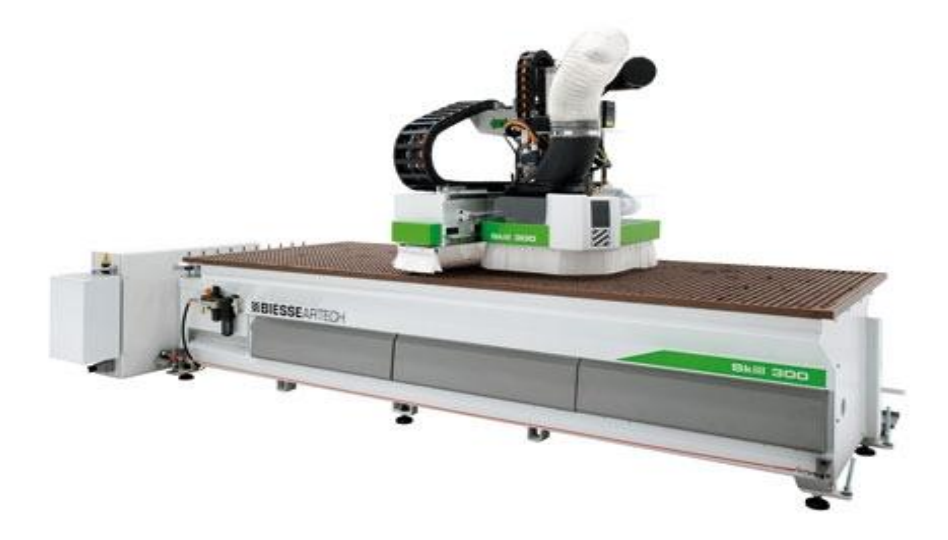
Figure 2. Biesse CNC router

Machinery, a brand new Biesse Skill 300 CNC machine center is pricing at $98,500 (tools included) (TNG Machinery New Used Listing –Winter, 2009).