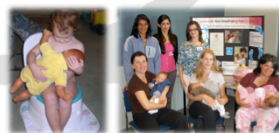
Figure 5, 6. Images from Vancouver Breast Feeding Challenge, 2010