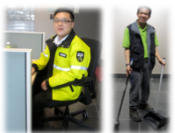
Figures 2,3. Non-healthcare workers from VCH

An educational online (moodle) module needed to be developed that could be used for all non-health care workers. This online education module will be rolled out in the near future as part of the existing orientation package that all new employees of Vancouver Coastal Health complete.