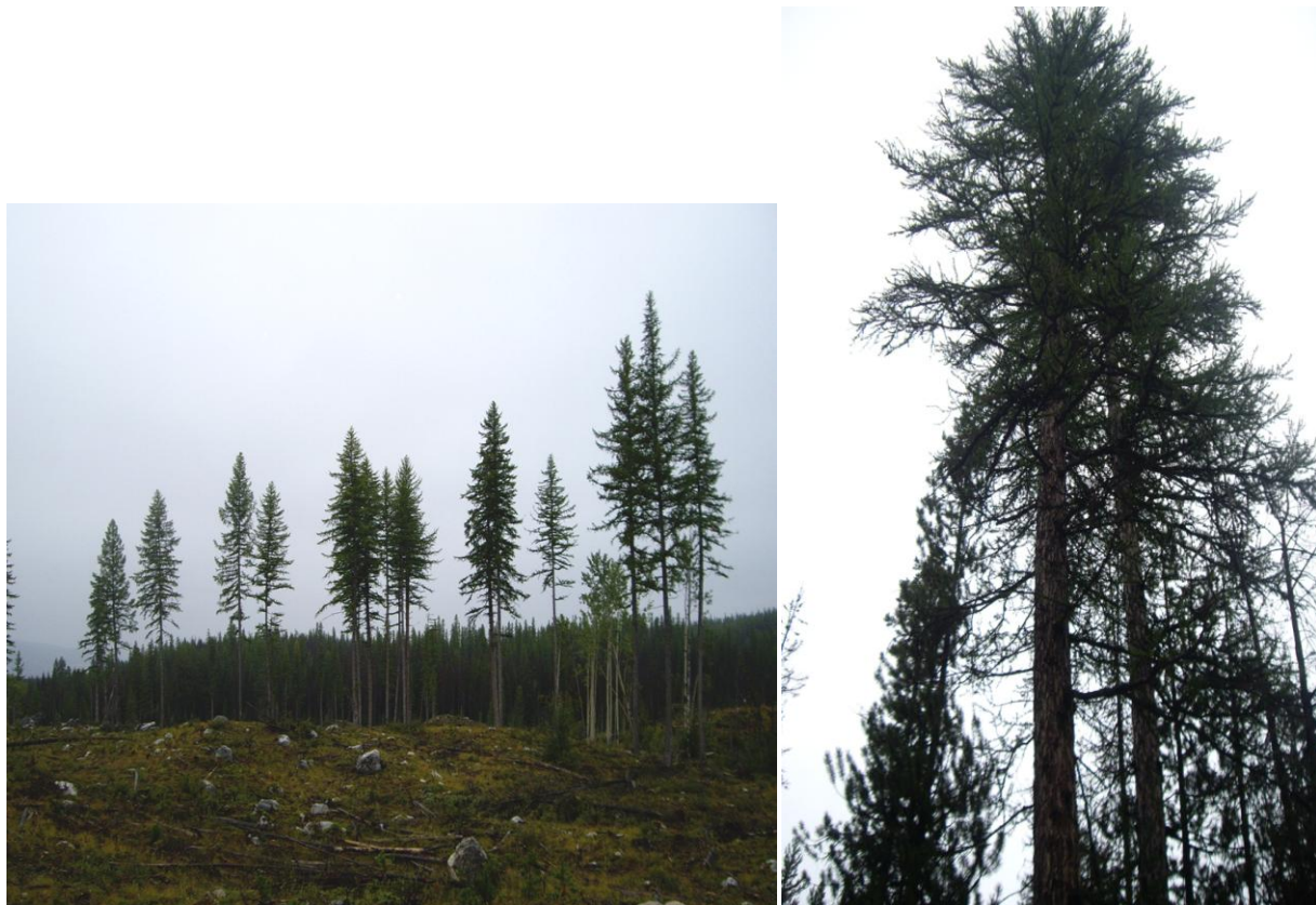
Figure 7. Mature 170yr old western larch stand. To the left is a cohort of western larch left over after selective harvest of lodgepole pine stands. The picture on the right depicts the immense size that western larch trees can achieve.

Evidence of old growth western larch can be found northwest of Merritt near Tyner Lake ( Figure 1 Plot 9 ). These trees are 170yrs old and are free of pests and disease. The dead lodgepole pine is evident to the right of the large western larch tree in the photo below. This is the westernmost western larch population in BC and represents past western larch distribution. Below are pictures of this mature western larch stand coupled with their site specific data.