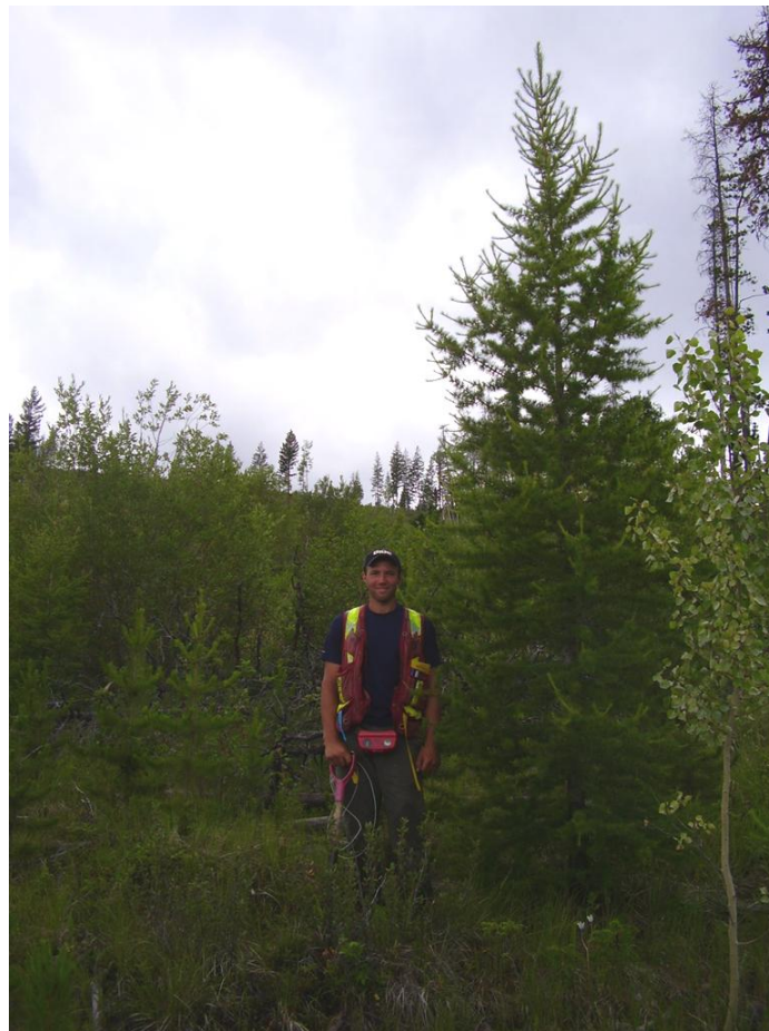
Figure 5. Western larch on a very dry site growing well and free of damage

With a slightly lesser component of western larch, successful western larch reforestation is evident on the same Woodlot 1606 site that is less productive. The site is Interior Douglas- fir dry, cool and a relatively high component of western larch exists. Stocking density is less than the wet site and the western larches were declared “free to grow”. The site is monitored by forest professionals as with the woodlot 1606 wet site. It appears that western larch can succeed and flourish on slightly drier sites which are less productive and at a low density. The site is at 1230m elevation and is close to the border to the Montane Spruce Zone.