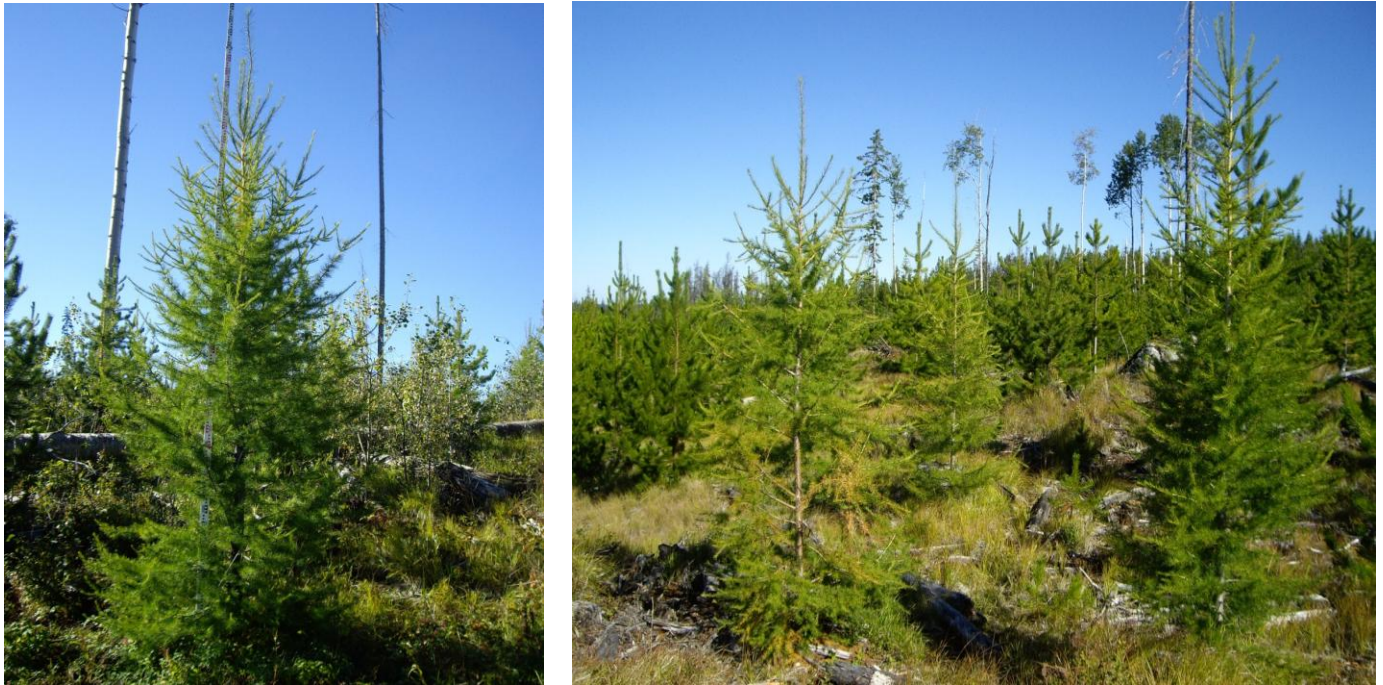
Figure 3. Western larch growing on a productive site in Woodlot 1606. Note the vigorous leader growth.