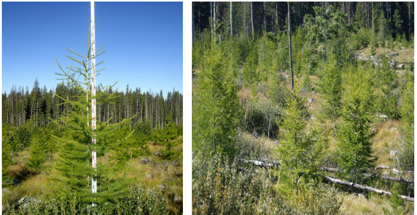
Figure 4. Western larch on a dry site on Woodlot 1606 that is lower in productivity.

larch progress and the monitoring of post “free to grow” status we can start creating a framework for western larch reforestation that includes recommendations on a site series specific basis. The western larch on this site is growing well so it is appropriate to assume that western larch can succeed on a productive site in the MSdm1 BEC zone out of its natural range.