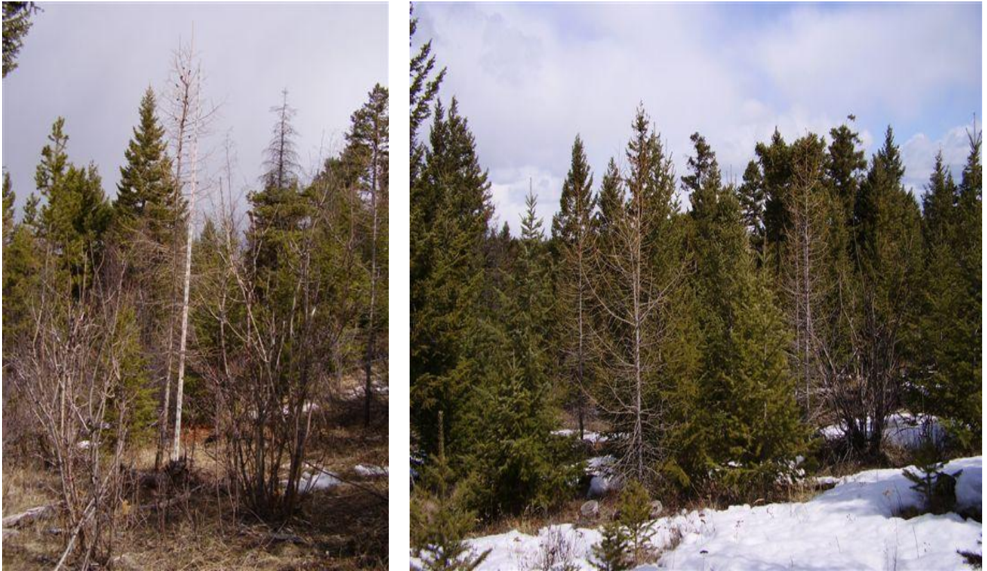
Figure 6. 15 yr old western larch in late winter. Note that cone production has begun in the upper crown (left)