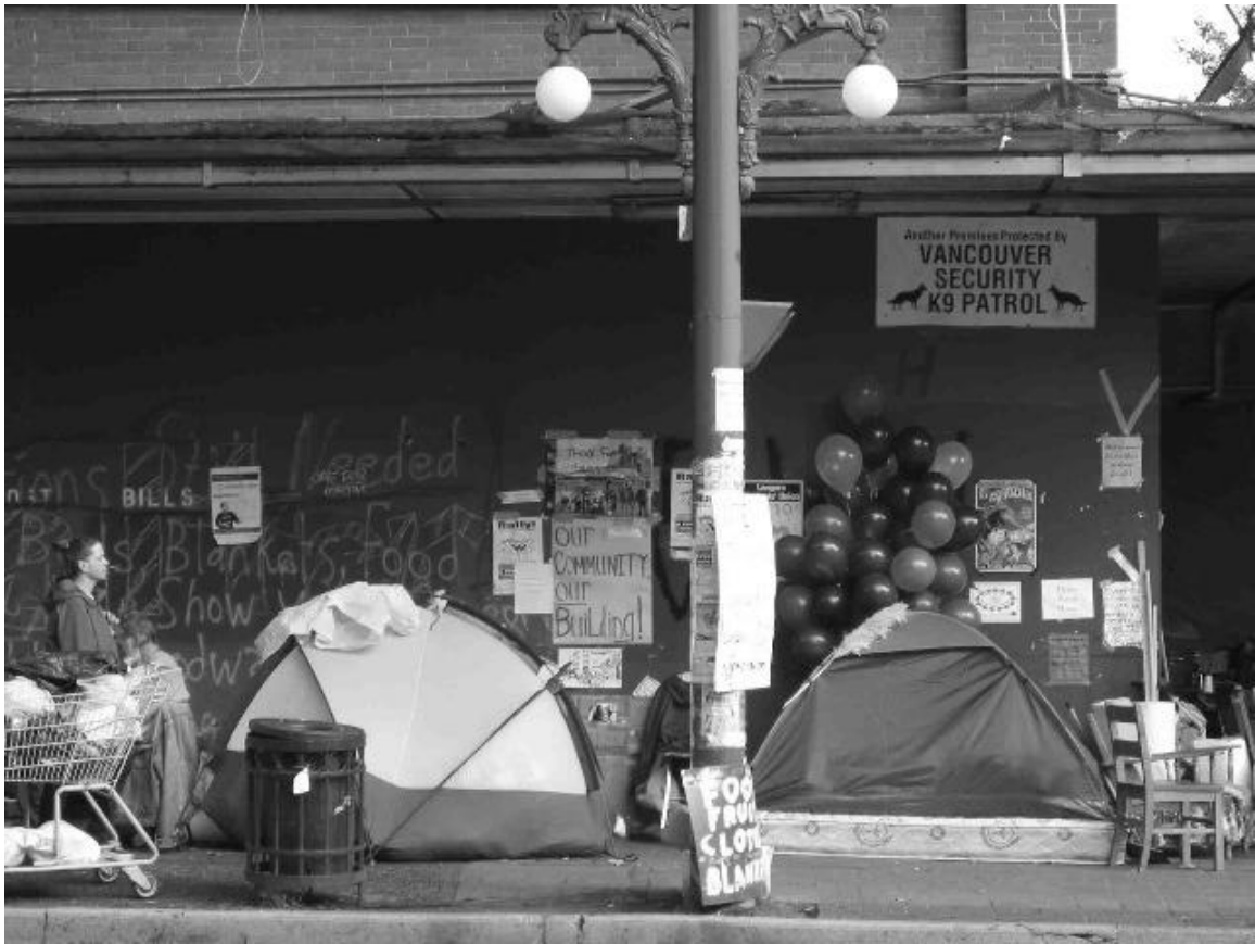
Figure 3 Woodsquat