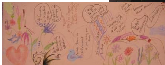
Results from a CACTUS day discussion table

Visit our webpage for up-dates and detailed information about our current and past projects!