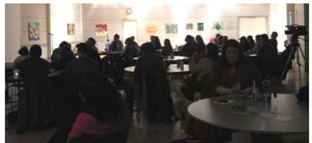
Listening to smoking cessation experiences

The investigators are currently in the process of applying for funding to conduct further research about the process of knowledge translation regarding tobacco cessation interventions within the mental health community in Vancouver.