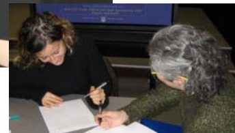
Coming up with "key messages"

The next KT Workshop is: Producing Policy Relevant Work November 19th 9 AM to 11 AM BC Centre of Excellence for Women's Health or WebEx E-mail: nexus@nursing.ubc.ca for more details