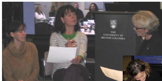
Practising our interviewing skills