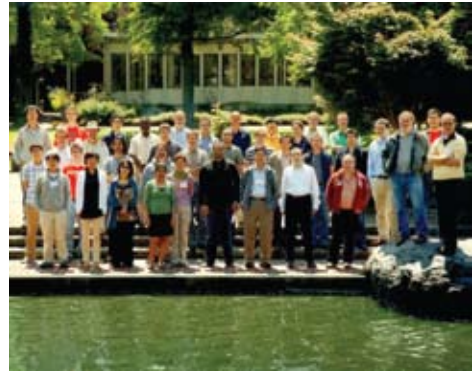
Attendees of the Canadian Young Researchers Conference in Mathematics and Statistics