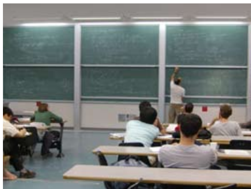
Workshop on Geometry Related to the Langlands Program