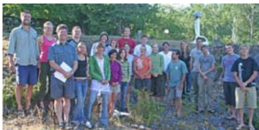
Participants of the Annual North/South Dialogue in Mathematics/Alberta Colleges Mathematics in Red Deer, Alberta