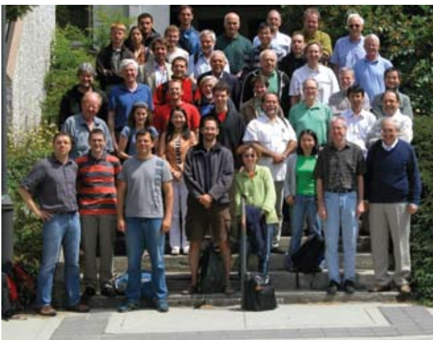
Participants of the Renormalization Group and Statistical Mechanics

The conference The Renormalization Group and Statistical Mechanics was organised by David Brydges (UBC), Joel Feldman (UBC), and Aernout van Enter (Groningen). The meeting had over 50 registered participants, 23 of whom gave talks. Some of the highlights included recent progress by the Italian school in the derivation of critical exponents in two dimensional lattice systems, advances in the finite temperature Cauchy-Born problem, insights into the connection between Gibbs structure and choice of renormalisation group map.