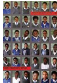
Students from Fezeeka Secondary School