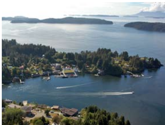
Bamfield, British Columbia