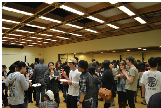
Asia Club Meet and Greet