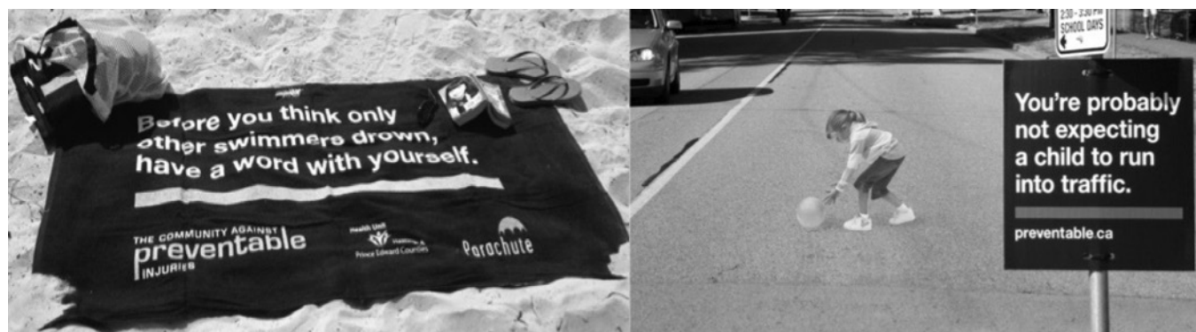
Figure 3 Preventable messaging at the time and place that injuries are likely to occur.

evaluation tended to be more fatalistic about injuries, indicating that it is not feasible, or even desirable, to prevent all injuries. These parents felt that children needed freedom to test their limits and that some risk was the cost of the learning experience vital to normal healthy growth and development. At the same time, they expressed a strong need to set a good example and take more precautions when in the presence of their children. These findings are reflected in the current study, with parental status predictive of higher scores on preventability and conscious thought.