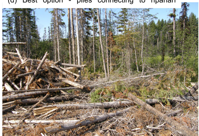
(d) Best option - piles connecting to riparian