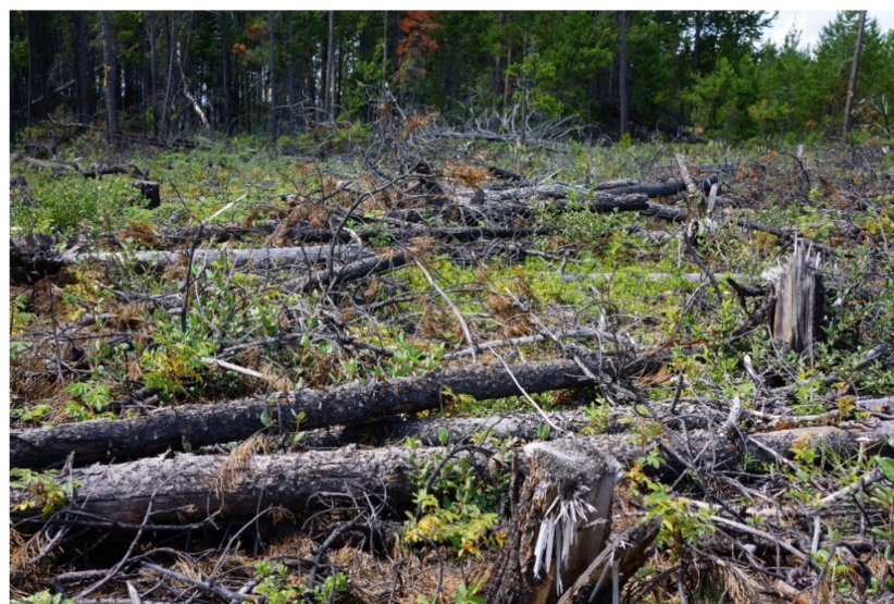
Figure 6. Untreated (elevated) slash two years after harvest.

Using various machines postharvest for site preparation and fuel management may result in small (<7.5 cm) material being chopped into pieces and pushed into the soil, increasing relative humidity and reducing flammability [87]. Fines (needles and small