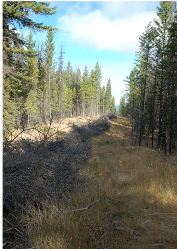
Figure 12. Length of woody debris fence.

affect tree growth [105]. A study in eastern Washington found growth and survival of Douglas-fir and lodgepole pine seedlings on plots with chipped woody debris was poorer than in plots where the debris was left intact or removed [106]. Ref. [102] found improved lodgepole pine seedling survival on decompacted log landings with wood waste added to the surface or incorporated into the soil. Rough mulching or, preferably, whole logs of various diameters and lengths provide microsites with moisture, shade, and protection to plant and animal biodiversity [96].