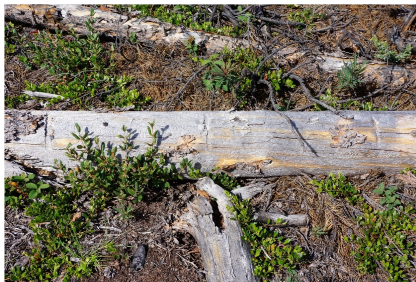
Figure 5. Postharvest material pressed into the ground with a roller–chopper mechanical treatment.

There has been considerable interest in the use of mechanical mastication to address several fuel and fire management issues including the rate of spread, fire behaviour and fire intensity on low-topography ground [82–86]. Mechanical mastication of fuel beds has been used in shrub ecosystems and following harvest to address fire behaviour concerns. Mastication dramatically changes the nature of the fuel bed without reducing the overall amount of fuel. The results of numerous field trials [84] suggest mastication may reduce the rate of fire spread but can prolong fuel bed smouldering. A key aspect of mechanical, postharvest treatment of logging slash is the breaking up of fine fuels and the pressing of slash into the ground, thereby increasing soil contact and the moisture content of fuels treated in this manner (Figures 5 and 6). Under drought conditions, elevated fuels will have lower moisture content, leading to increased fire-line intensity and an increased rate of spread [83].