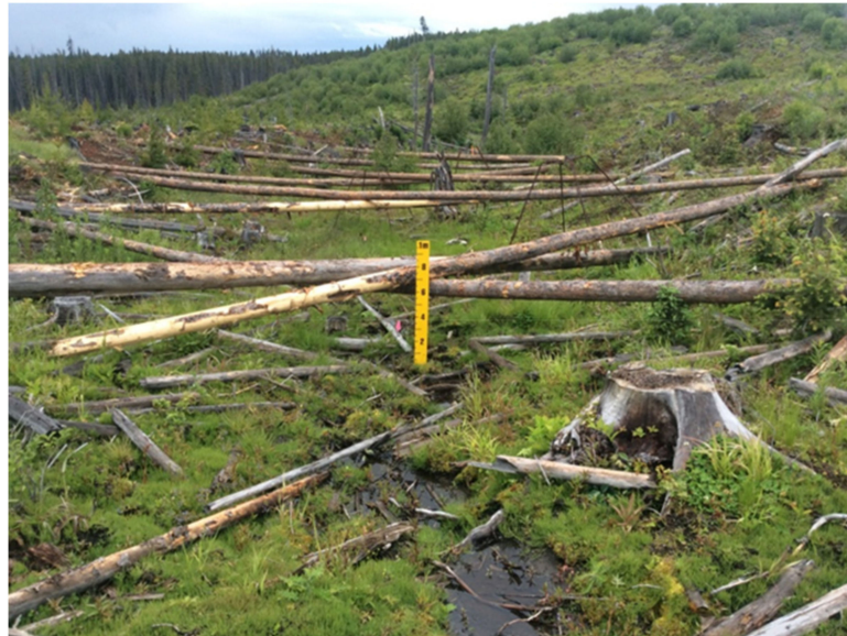
Figure 8. Cross-sectional view of log obstruction across riparian area.

tion stages. Openings in the barriers every 100 m or so will accommodate movement of native ungulates. An indication of similar positive results with fallen trees and branches as woody debris placement was reported for cattle in pastureland in southern Manitoba [94]. Windrows of debris placed parallel to a stream (Figures 10 and 11) are also an effective barrier for cattle [93,95].