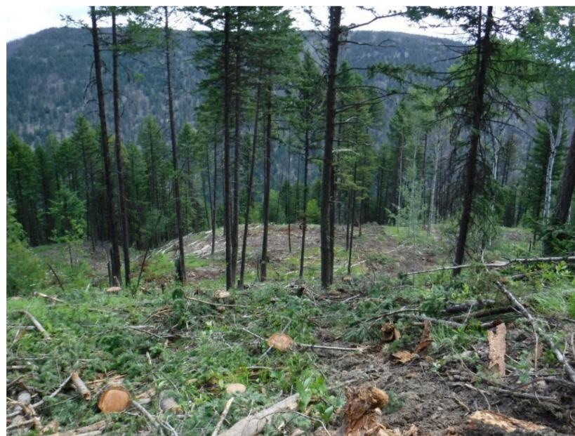
Figure 4. Partial cutting (uniform shelterwood) of Douglas-fir stand and distribution of postharvest woody debris within stand.