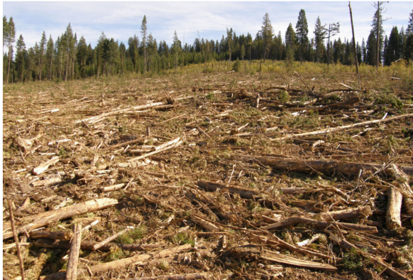
(a) Poorest option – minimal vertical structure to habitat