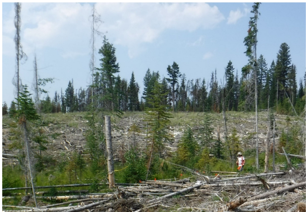
Figure 11. Linear windrow of woody debris to protect logged riparian area from cattle.