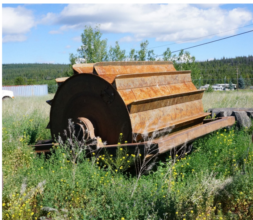
Figure 7. Example of a roller-chopper machine for treating postharvest debris.

branches) are flattened onto the ground and larger pieces (>7.5 cm) are pushed onto or partially into the ground but are not chopped into small chunks. Unlike mechanical mastication, which can aerate fuels and create a relatively uniform fuel bed, heavy rollers that press logging slash into the ground (Figure 7) may hold promise but have not been widely tested for efficacy. Leaving the slash on site in this condition should increase the rate of decomposition and increase the loss rate of fine fuels on site via decomposition. In addition, this processed slash material keeps important nutrients on site for future tree growth and increases overall site productivity. Soil biota should benefit from this form of leaving nutrients and energy for decomposers and invertebrates on site. However, this process can be detrimental for saproxylic organisms that depend on intact wood, such as many species of saproxylic beetles. Different types of dead wood (size, position, moisture, sun-exposure) are used by different species [88]. In addition, some threatened species preferentially colonise intact wood over cut and damaged smaller pieces [89].