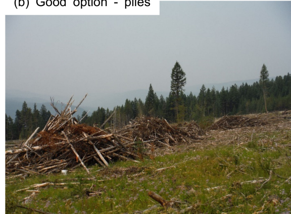
(b) Good option - piles