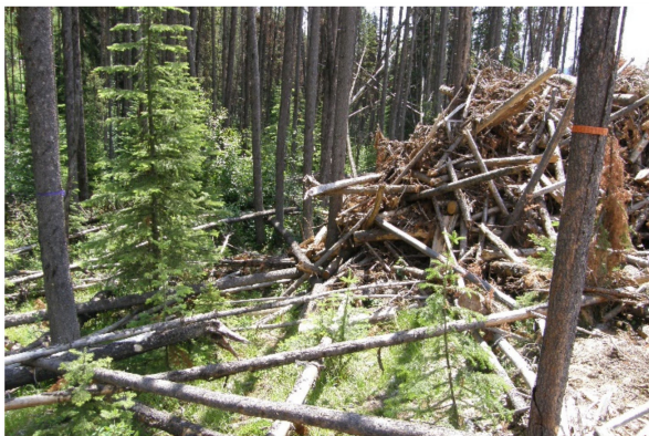
Figure 3. Options for construction of woody debris habitats: the poorest (a) minimal vertical structure to habitat; good (b) piles; better (c) linear row of piles; and best (d) piles connecting to riparian; and best (e) piles connecting to forest reserve.