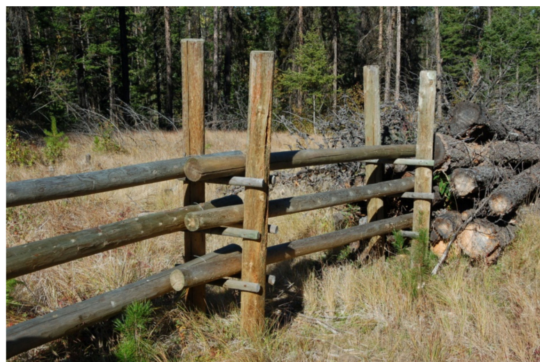
Figure 13. Wildlife/cattle gate and removable rails. (Photo by A. Pantel).

Wood mulch is useful on dry, arid soils, and does not constitute a fire hazard. Sites with whole logs provide erosion control, moisture retention, creation of microsites, heterogeneity on sites, pose a minimal fire hazard if compressed into the soil, and have improved seedling