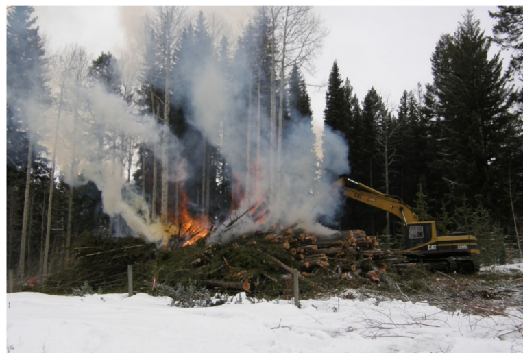
Figure 1. Burning of debris pile.