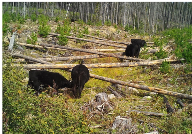
Figure 9. Cattle able to access stream for water but not move up and down channel.