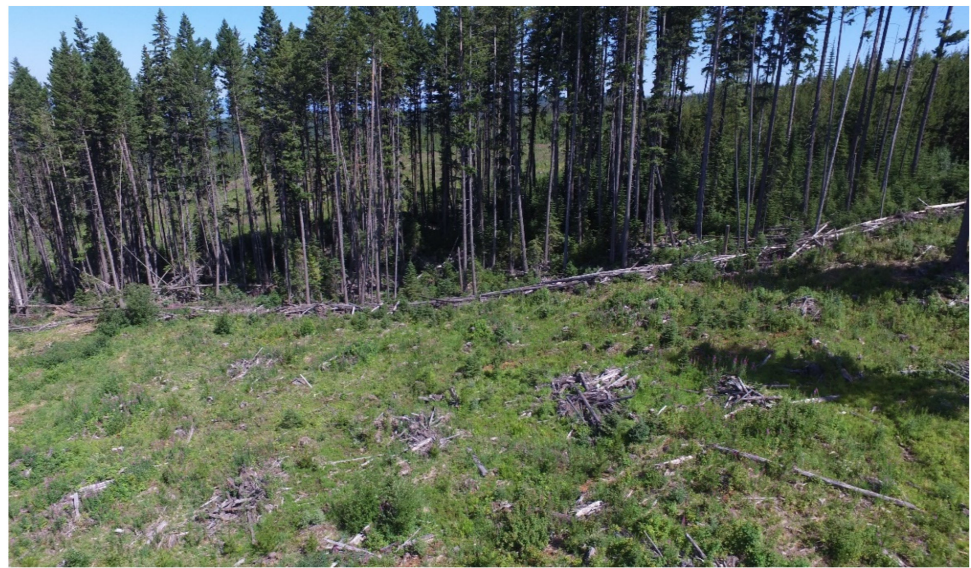
Figure 10. Linear windrow of woody debris to protect unlogged riparian area from cattle.