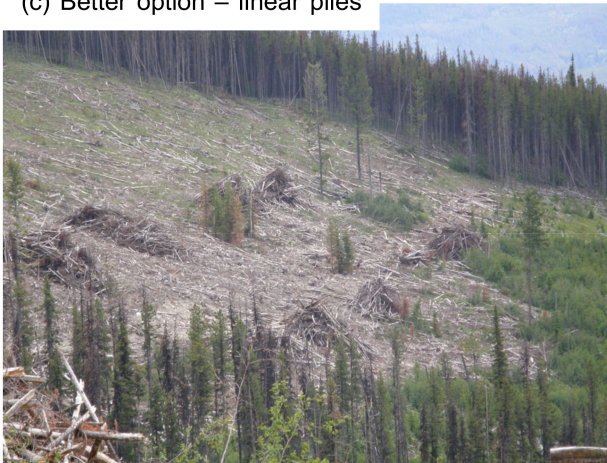
(c) Better option – linear piles