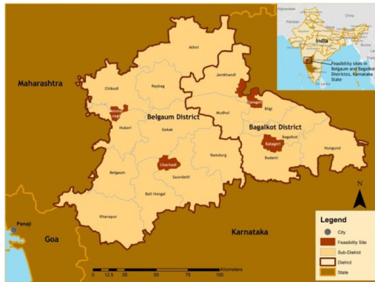
Fig. 1 Map of the study site

health services to rural areas. ASHAs are females between the ages of 25 to 45 years, with an education equivalent to grade eight or higher, who are selected by the local government to serve in their residential areas. Each ASHA extends her services to a population of about 1000 individuals. ASHAs are trained to provide health care advice in the homes (provision of basic maternity care, child care and nutrition counselling), create community health awareness, conducting social