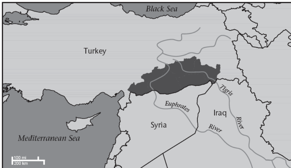
MAP 1: Southeastern Anatolia