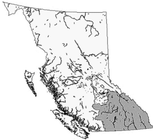
Figure 1: Region of Interest for Health Study. The shaded area in the south-east corner of the province constitutes the study area.

This report concerns a small component of a larger health study which seeks to assess the health effects of exposure to the wildfire smoke during the summer of 2003 in Southern Interior British Columbia. The study region, consisting of a population of approximately 638 800 people, is shown for reference in Figure 1.