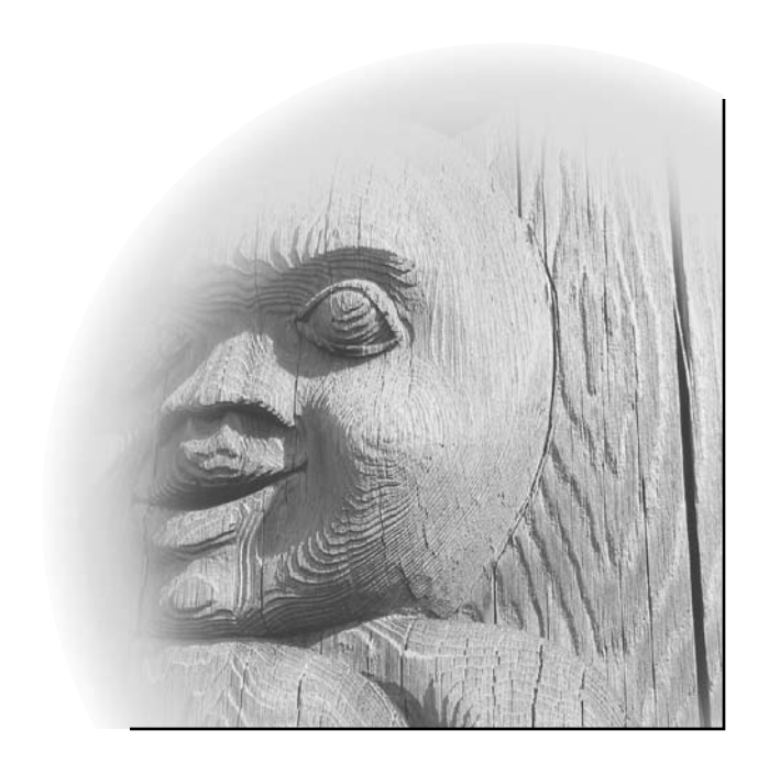
PARADOXES AND CONTRADICTIONS IN HEALTH POLICY REFORM

New Investigator, Canadian Institutes of Health Research Scholar, Michael Smith Foundation for Health Research School of Nursing, University of British Columbia