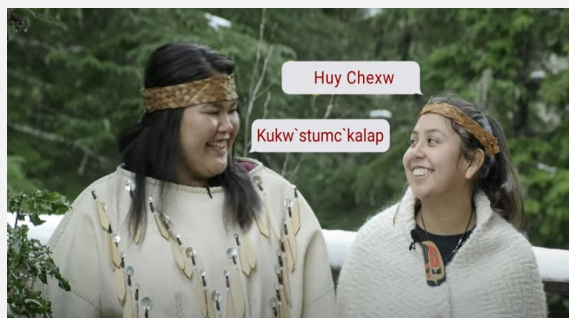
Still from Squamish L'ilwat Cultural Centre Language Video via YouTube tinyurl.com/SLCCLanguageVideo

UBC Open Access Fund: In collaboration with the Library's Scholarly Communications & Copyright Team, cIRcle archived nearly 40 digital books and research articles made freely available with the support of the UBC Open Access Fund for Humanities and Social Sciences Research . Administered annually, the fund covers fees for article processing charges (APCs) where UBC faculty publications align with SSHRC grant-funding guidelines.