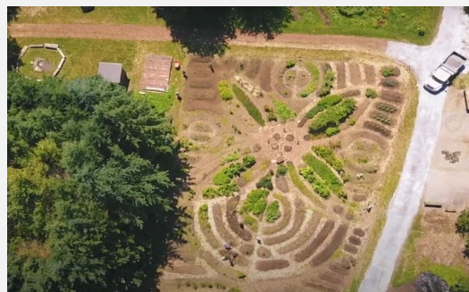
Still from "xʷc' ic' əsəm Garden : The place where we grow—UBC Farm" via YouTube tinyurl.com/w2ewr73e

Transcending Political Dissonances : Music as an Instrument of Diplomacy