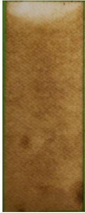
Membrane fouling & wetting