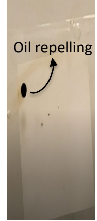
No fouling or wetting

Solution: Engineered membrane for clean water