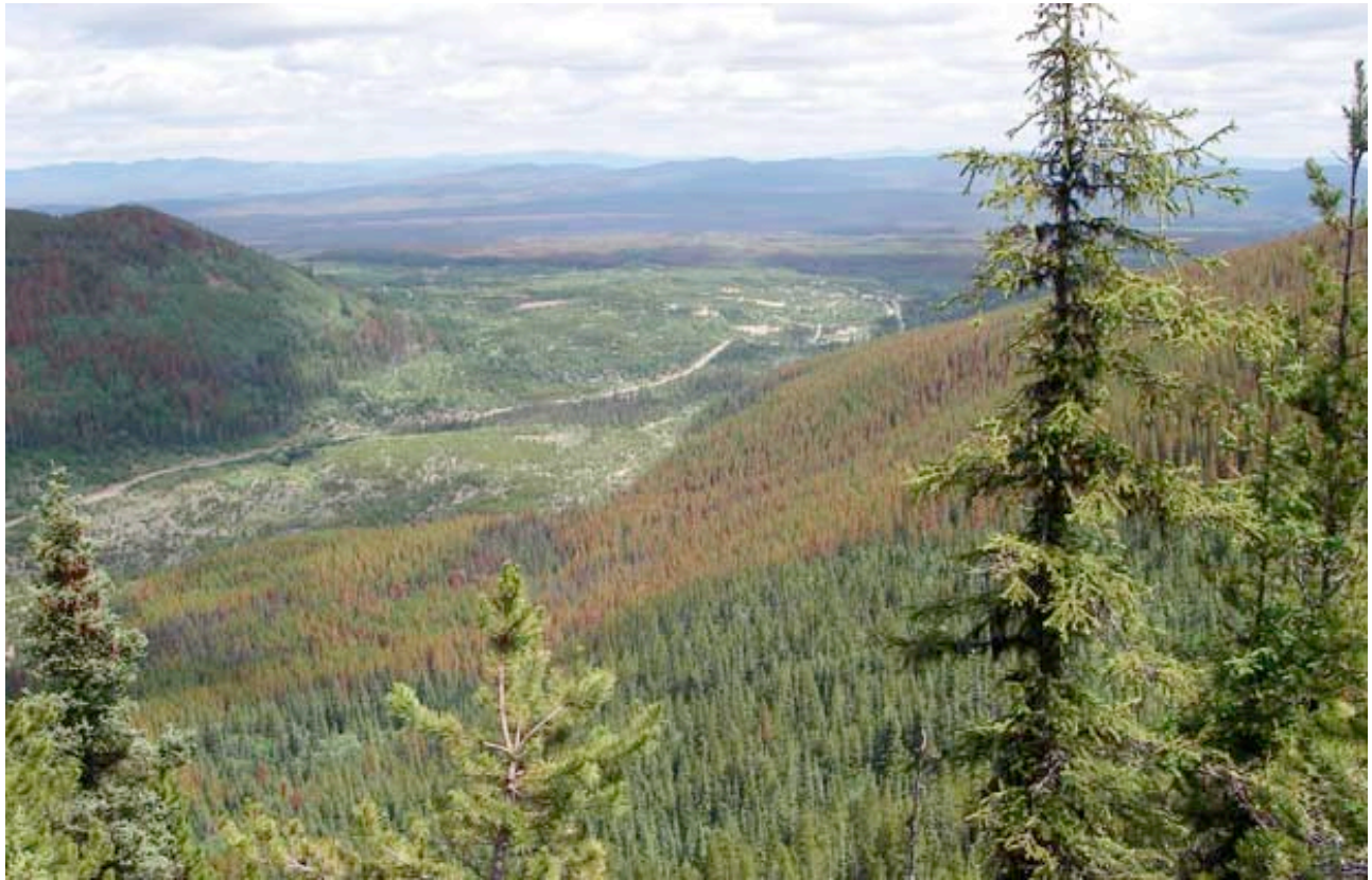
(MT. MILLIGAN SITE (TERRANE CORP, 2009))