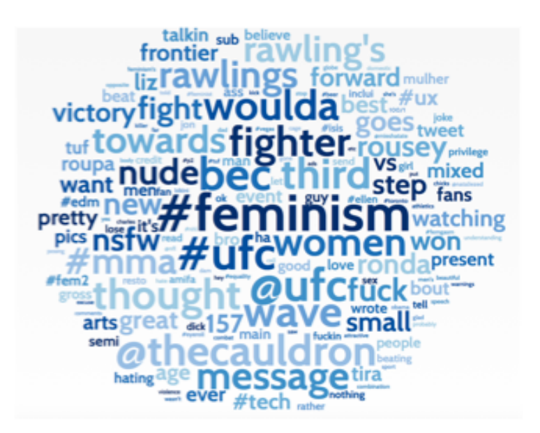
Figure 4 shows the words that were present in the initial search for tweets containing #feminism and #UFC on Twitter.