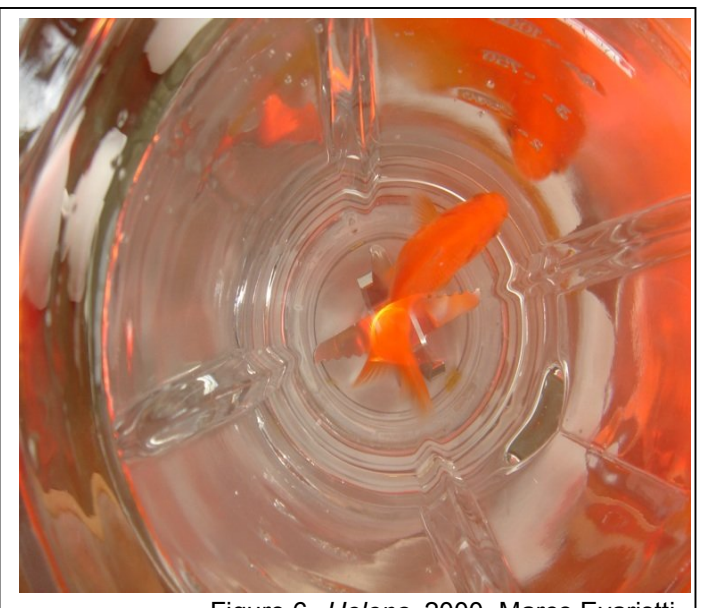
Figure 6, Helena , 2000, Marco Evaristti (View from inside a blender) Reprinted with permission from the artist.

Helena temporarily erases the imaginary line that separates viewers from the temptation that they may feel when offered the choice to engage in pointless acts of cruelty, while simultaneously creating an empathetic/voyeuristic response in other viewers. When faced with this installation, viewers must weigh several options. They