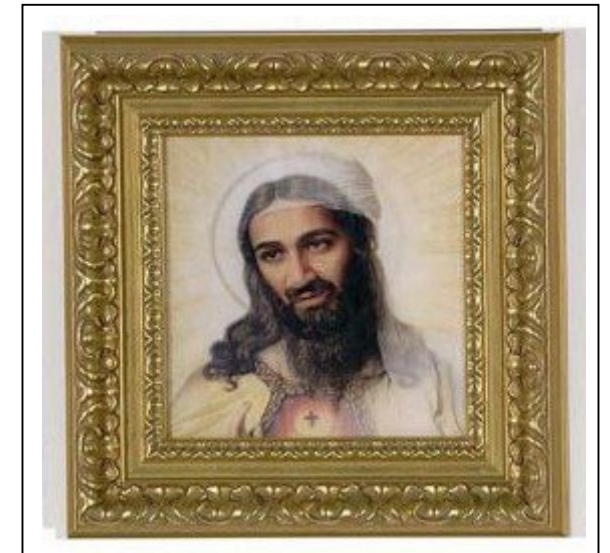
Figure 7, Bearded Orientals: Making the Empire Cross, 2000, P. Bracks, (view of overlapping portraits) Reprinted with permission from the artist.

Bearded Orientals: Making the Empire Cross offers the viewer two recognizable portraits as the principle visual element. The majority of participants felt that the overlap signifies similarity between the two figures, rather than representing opposite sides of a continuum. A few participants looked toward the hologram effect itself as a source for metaphor. Gerome wondered