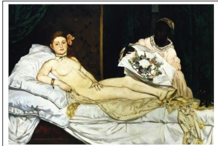
Figure 1, Olympia, 1863, Manet

Throughout the past several hundred years, visual art that has transgressed cultural precepts has expanded the breadth and capacity of artistic commentary (Cashell, 2009, p.1). While