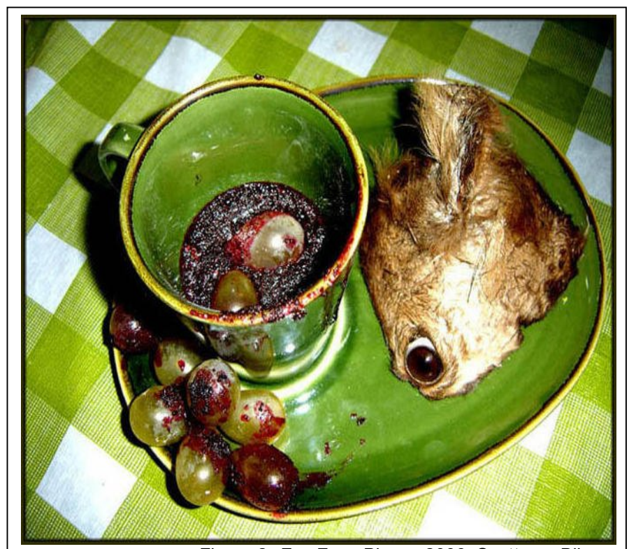
Figure 2, Fox Face Platter ,2006, Scott a.a. Bibus, Reprinted with permission from the artist.

Bibus is a member of the Minnesota Association of Rogue Taxidermists, an association that has a 'no kill' code of ethics. The piece Fox Face Platter is a reflection of this credo, as it casts light on our absurdly hypocritical relationship we have with dead animals. This sculpture is a cup and saucer with a partial fragment of a taxidermy fox mask with one eye peering upward. Inside the cup are grapes floating in a thick red liquid. Red smeared grapes are also placed alongside the cup, as though prepared for a small meal. In an artist interview by Thomas McIntyre (2009), Bibus stated that Fox Face Platter as a statement regarding contradictions he sees in the American way of life, which include analogous to the ways Americans cope with death. This piece was chosen as it offers several articles (cup, saucer, grapes, partial animal face, red liquid)