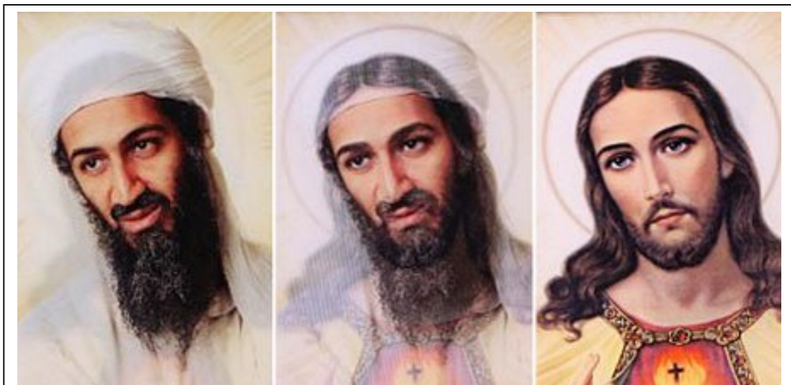
Figure 3, Bearded Orientals: Making the Empire Cross, 2006, Priscilla Bracks (split view of hologram, each panel representing a view from a particular angle) Reprinted with permission from the artist.

This art piece openly questions doctrinal suppositions of good and evil as defined by 21<sup>st</sup> century Western history. In Bearded Orientals: Making the Empire Cross , Bracks juxtaposes the images of Jesus Christ and Osama Bin Laden in a lenticular hologram print that shifts from one face to the other when viewed from different angles. The artist's intent is not one of equating the two historical figures, but rather as a means to open purposeful discourse on "relationships between media, popular culture, and the development of truth, history and ideology" (Bracks, 2007). While Bracks sees Jesus' place in history is clearly defined, this piece contemplates how Bin Laden will be portrayed, as either incarnate of evil or religious martyr. Joining such powerful symbols